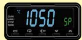
Example of an over-temperature limiter