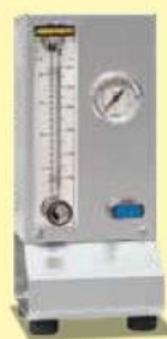
Gas panel for one non-flammable protective or reactive gas (N 2 , Ar, He, CO 2 , air, forming gas)