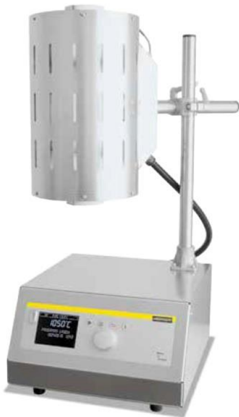
Tube furnace RT 50/250/13

These compact tube furnaces are used when laboratory experiments must be performed horizontally, vertically, or at specific angles. The ability to configure the angle of tilt and the working height, and their compact design, also make these tube furnaces suitable for integration into existing process systems.