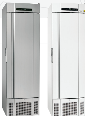
The BioMidi EF425 is available in either white, aluminium or stainless steel finish. All models come with selfclosing door.

The functional design ensures easy, ergonomically correct access to the storage space.