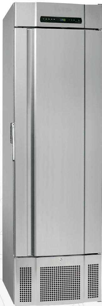
BioMidi EF425. Drawers are optional extras.

The BioMidi EF425 cabinet is a low temperature freezer that operates in the temperature range -5/-40^{\circ}\text{C} . It is a high capacity ventilated refrigeration unit that makes sure the interior quickly returns to the specified temperature after the door has been opened.