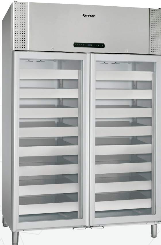
BioPlus 1400. Drawers and glass doors are optional extras.

The BioPlus 1270/1400 range is designed for the storage of the most delicate biomaterials, in situations where even tiny fluctuations in conditions inside the storage cabinet can have a serious effect on the contents.