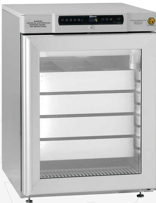
BioCompact II RR210. Drawers, reference container and glass door are optional extras.

Available in either white or stainless steel finish, with a one-piece moulded ABS inner lining. Shelves and drawers are mounted in U-shaped rails moulded into the plastic walls.