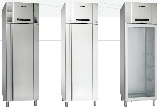
The BioPlus 600/660D is available as a refrigerator or freezer in either white or stainless steel finish. All BioPlus models come with self-closing door. Glass door is available for refrigerator.

In terms of performance, these units are designed to provide the very best results even under exceptional conditions. The BioPlus utilises environmentally responsible HFC-free foam propellants and is available with HFC-free refrigerants.