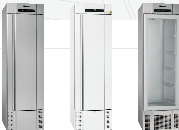
The BioMidi 425 is available as a refrigerator or freezer in either white, aluminium or stainless steel finish. All BioMidi models come with selfclosing door. Glassdoor is available for refrigerator.