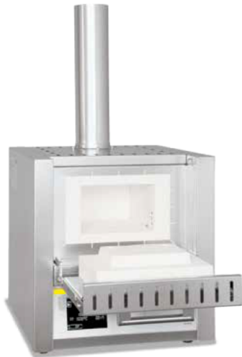
Ashing furnace LV 3/11

Ashing furnace LV ../11 is designed especially for ashing processes to 1050 °C in the laboratory. Applications include determining loss on ignition, ashing food and plastics for subsequent substance analysis. A special fresh-air and exhaust air system ensures that the air is replaced 6 times per minute so that there is always sufficient oxygen for the ashing process. Incoming air passes the furnace heating and is pre-heated to ensure good temperature uniformity.