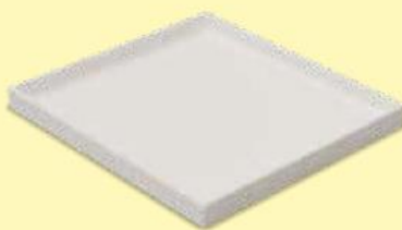
Ceramic collecting pan