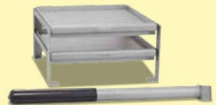
Charging trolley to load the furnace in different levels