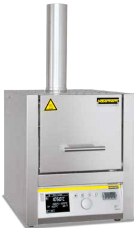
Ashing furnace LVT 5/11