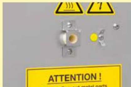
Ashing furnace LV 5/11 with port for thermocouple in the rear wall of furnace