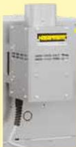
Chimney with fan