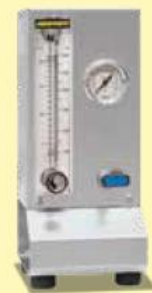
Gas supply system for non-flammable protective or reactive gas