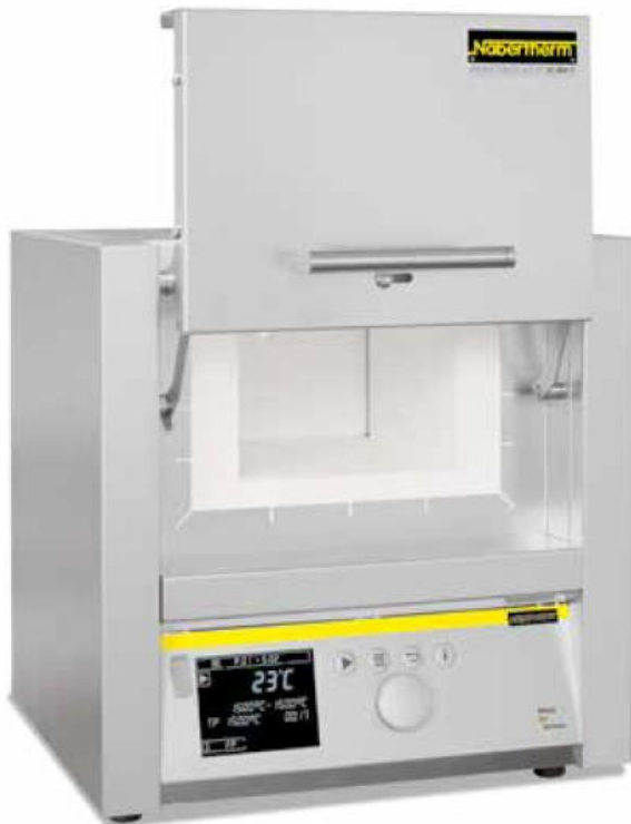
Muffle furnace LT 5/12 with lift door

The muffle furnaces L 1/12 - LT 40/12 have been proven for daily laboratory use. These models stand out for their excellent workmanship, advanced and attractive design, and high level of reliability. The muffle furnaces come equipped with either a flap door or lift door at no extra charge.