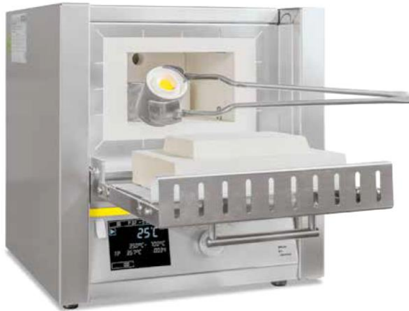
Muffle furnace L 3/11 with flap door