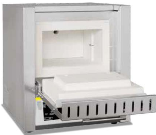
Muffle furnace L 3/11 with flap door