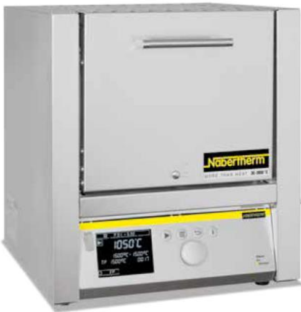
Muffle furnace L 3/12